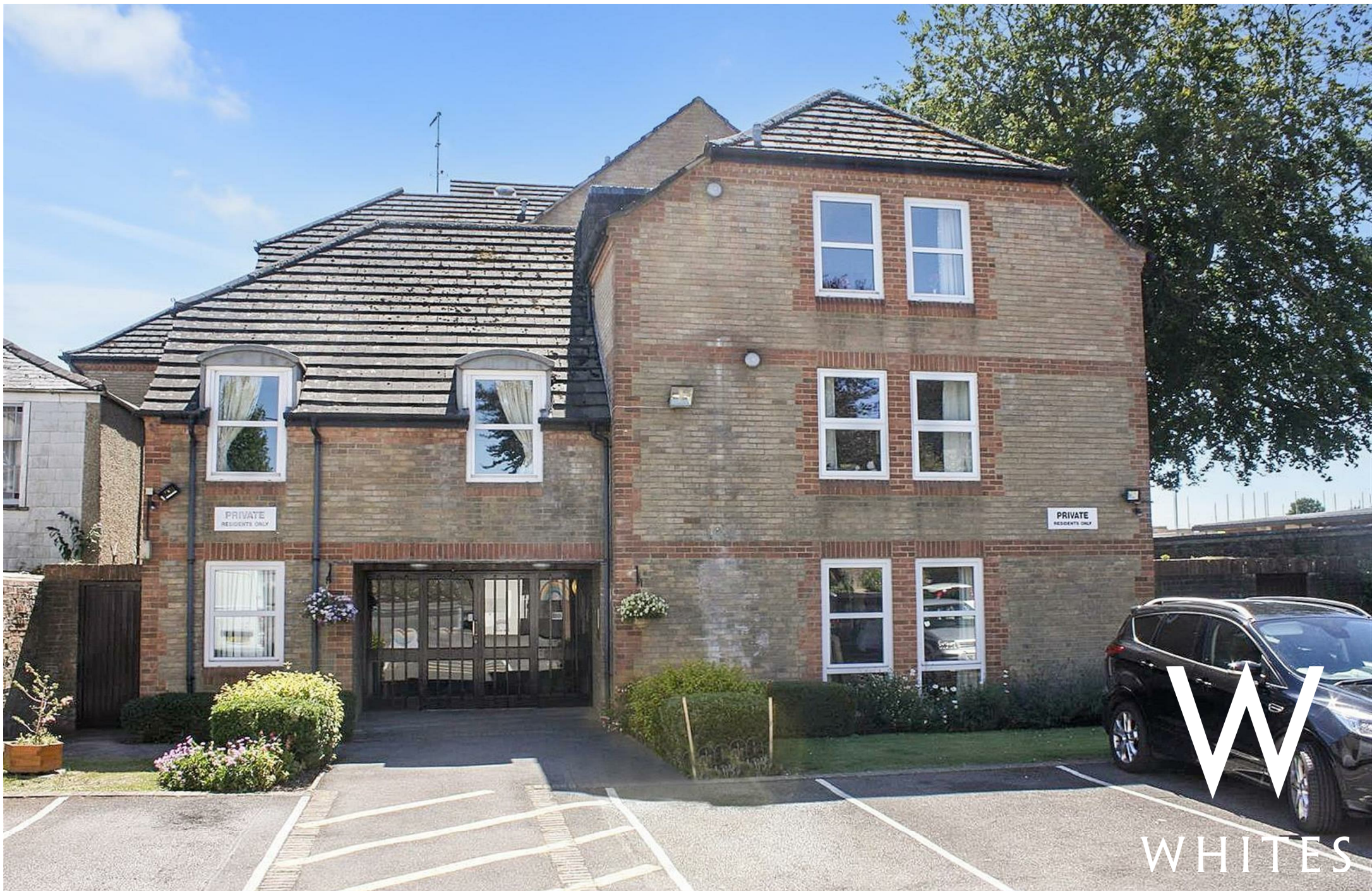
28 Home Sarum House, Wilton Road, Salisbury, Wiltshire, SP2 7HS